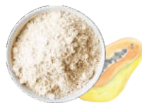
papaya 木瓜 1000g

Finely ground pearl reduces the appearance of wrinkles due to high amount of antioxidant and amino acid presence. Combining with milk, it lightens your skin by shedding off pigmented skin cells.