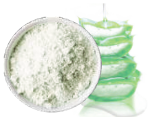
aloe vera 芦荟 1000g

Hydrates and tones the complexion to restore radiance and suppleness. Visibly smooth skin for a youthful dewy appearance.