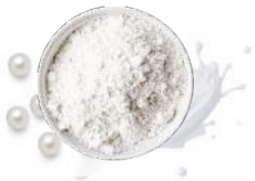
pearl and milk 珍珠牛奶 1000g

Helps calm down skin uncomfortable conditions. Refreshes and softens skin texture. Closes enlarged pores and smoothen the complexion.