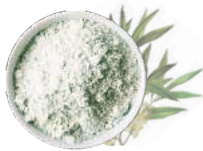
tea tree 茶树 1000g

Special formulated for oily skin. Rebalances skin oil, skin pores and refine skin texture. Refreshes and calms skin.