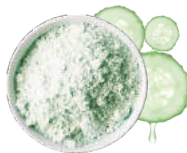
cucumber 黄瓜 1000g

Contains soothing antioxidant vitamin E that helps in anti-inflammation and improves skin barrier function.