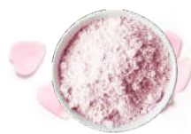
rose 玫瑰 1000g

Natural anti-bacterial agent that helps to treat blemishes, soften blackheads, and control excess oil.