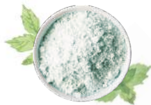
peppermint 薄荷 1000g