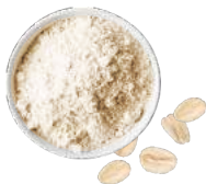
oat 麦 1000g