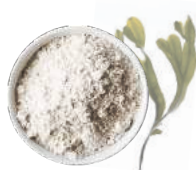
seaweed 海藻 1000g

Helps soothe, hydrate, and detoxify the look of dry, irritated skin with botanical extracts. Provides immediate hydration resulting in healthy, revitalized, and lush skin.